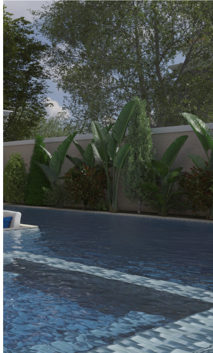
JVT RESIDENCE VILLA