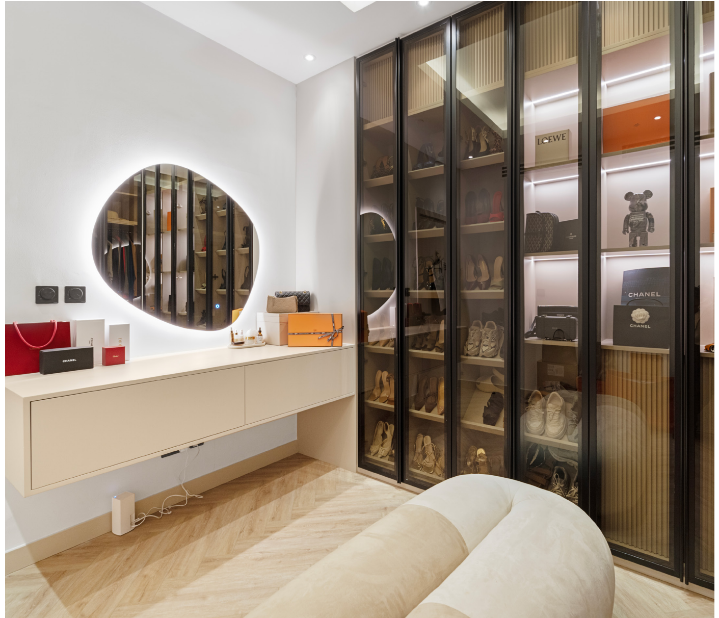
ONE PALM, PALM JUMEIRAH