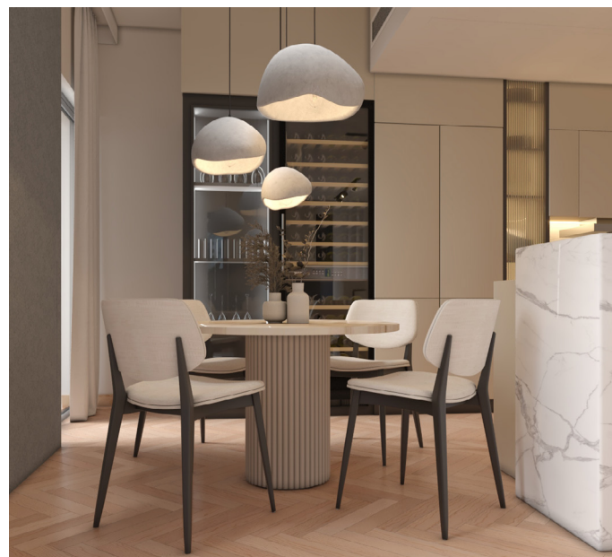
ELAN VILLA, TILAL AL GHAF