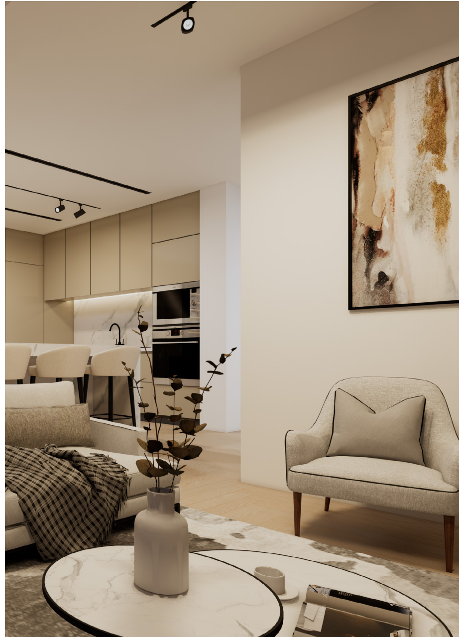
ELAN VILLA, TILAL AL GHAF