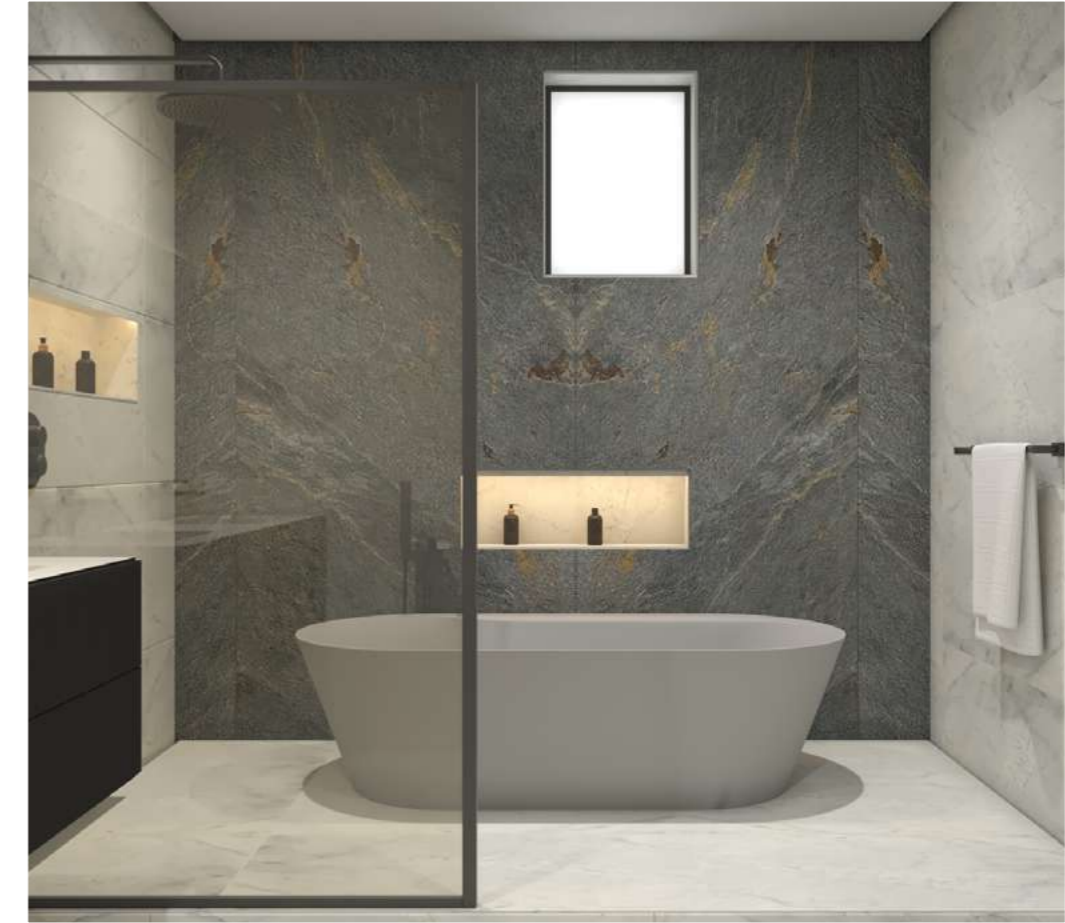
JVT RESIDENCE VILLA

At SOA Developments we are experts in building long-lasting relationships and beautiful spaces.