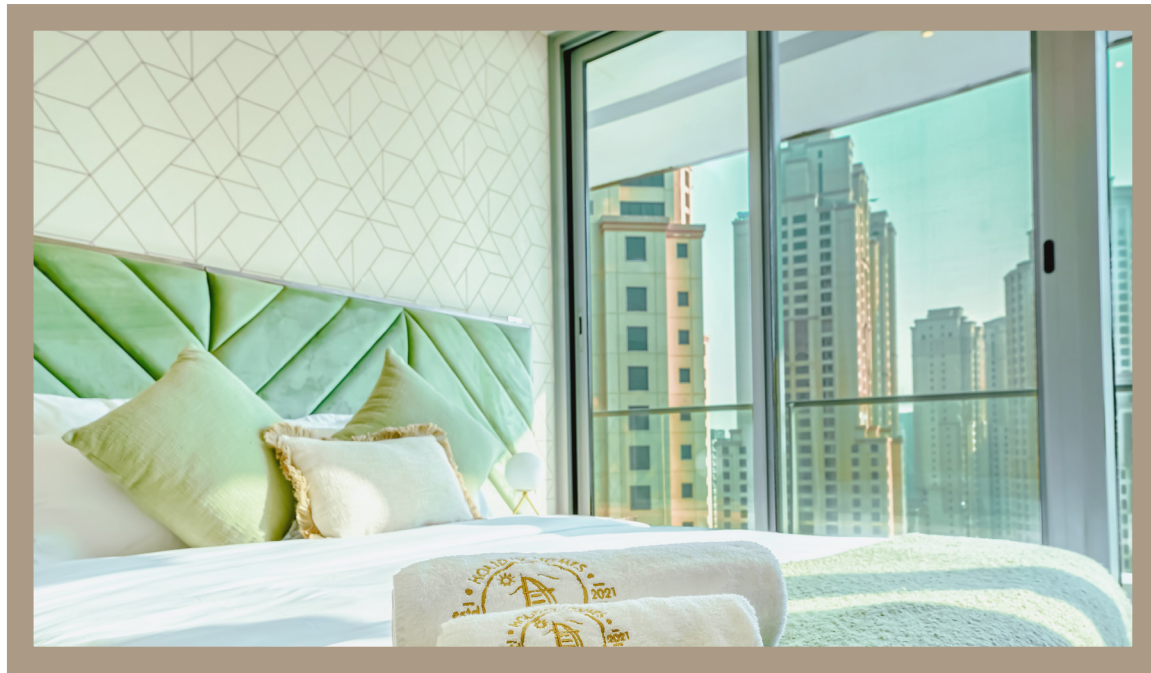
TRIDENT GRAND TOWER

This 360-degree renovation brings the client's vision to life with precision. A neutral palette and bespoke furnishings create a bright, modern ambiance. Meticulous attention to detail, from custom carpentry to kitchen wrapping, ensures a space that feels fresh and timeless, perfectly balancing style and function.