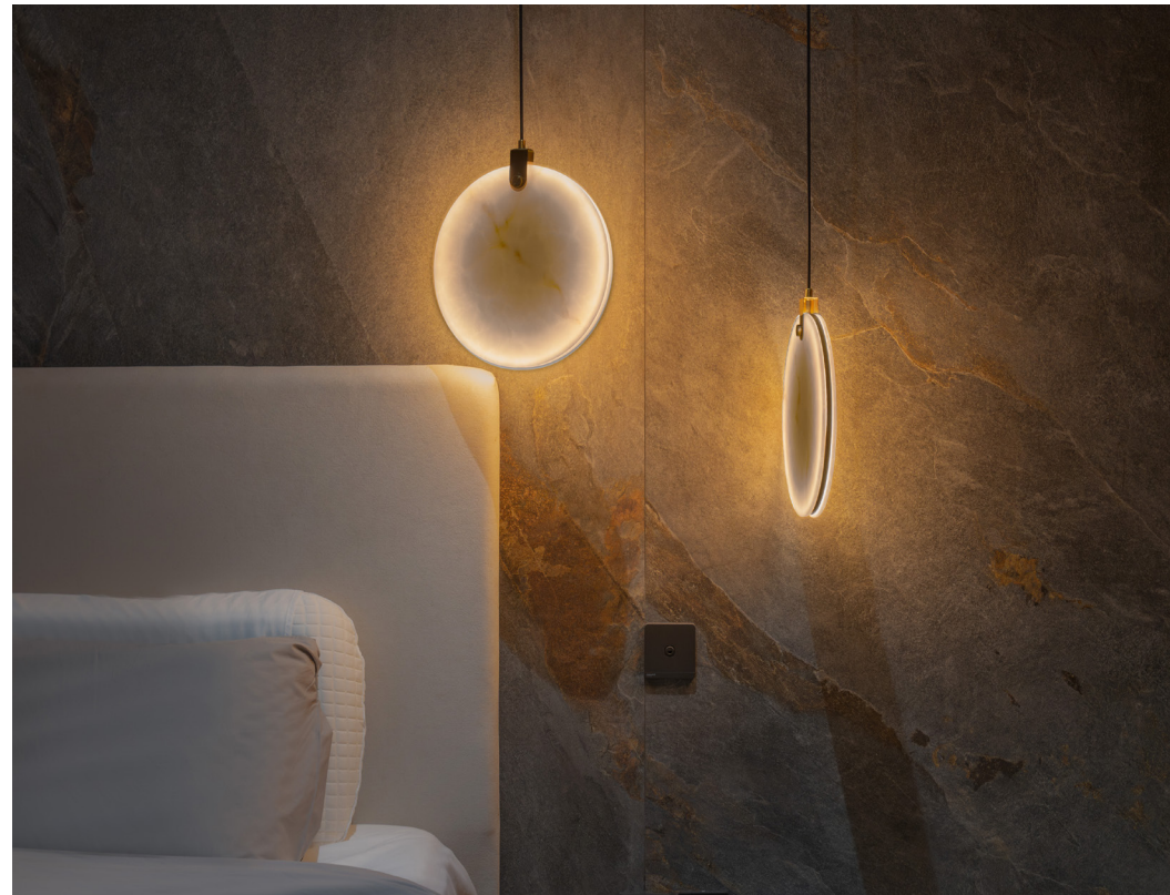
JUMEIRAH VILLAGE TRIANGLE